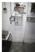
Reference: EST-31 Scale 150kg Year: . Brand: Mobba Width: .