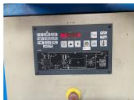
Reference: STV-016 SCREW COMPRESSOR 55kw Year: 1998 Brand: MARK Width: .