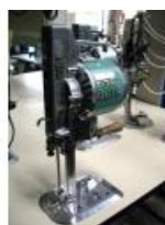
Reference: CUM-157 Cut Manual Year: . Brand: Pacer Width: .