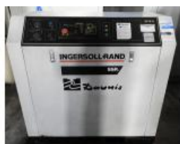
Reference: CTB-157A AIR COMPRESSOR 18.5KW Year: 1998 Brand: Ingersollrand Width: .