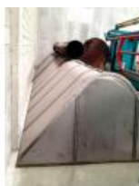
Reference: COT-001 Fume Hood Year: . Brand: . Width: .