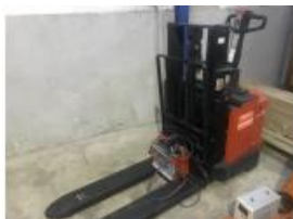
Reference: F-6501 LIFTER Year: 2000 Brand: BT Width: .