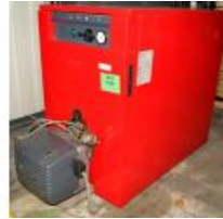
Reference: BLY-026 HEATING BOILER Year: 1997 Brand: Savio Width: .