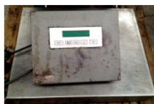
Reference: LUI-159 Scales Platform 60kg Year: - Brand: . Width: -