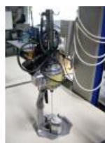
Reference: CUM-161 Cut Manual Year: . Brand: Singer Width: .