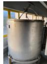
Reference: MIC-061E jacketed mix tank, 316 SS, 1.5... Year: 1997 Brand: LOPIK Width: .