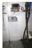
Reference: EST-30 Scale 150kg Year: . Brand: Mobba Width: .