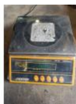
Reference: M-1585 SCALE 11kg Year: . Brand: JADEVER Width: .