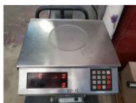
Reference: EST-32 Scale 30kg Year: . Brand: Mobba Width: .