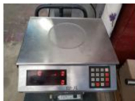
Reference: EST-32 Scale 30kg Year: . Brand: Mobba Width: .