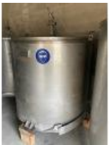
Reference: MIC-060E jacketed mix tank, 316 SS, 1.5... Year: 1997 Brand: LOPIK Width: .