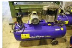
Reference: TPL-020 Compressor Year: 1997 Brand: Air Pack Width: .