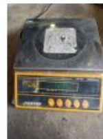
Reference: M-1585 SCALE 11kg Year: . Brand: JADEVER Width: .