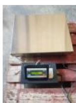
Reference: AZC-035 SCALE 60kg Year: . Brand: Sartorius Width: .