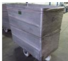
Reference: M-1514 Trolley Stainless steel For We... Year: 2012 Brand: . Width: .