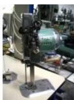
Reference: CUM-158 Cut Manual Year: . Brand: Pacer Width: .