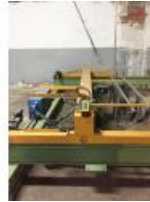
Reference: MTB-066 BRIDGE CRANE 2.5Ton Year: 2003 Brand: VERLINDE Width: .