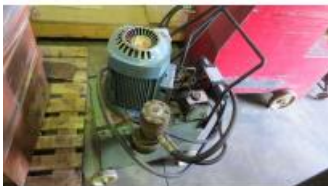
Reference: TPA-062 Hydraulic Unit Year: . Brand: Tapa Width: .