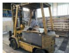
Reference: STV-020 ELECTRIC FORK LIFT 4000kg Year: 1989 Brand: CESAB Width: .