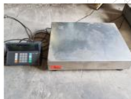
Reference: M-1588 SCALE 60kg Year: . Brand: TOLEDO Width: .