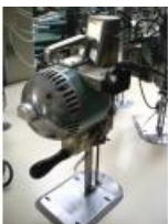
Reference: CUM-192 Cut Manual Year: . Brand: Pacer Width: .