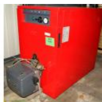
Reference: BLY-026 HEATING BOILER Year: 1997 Brand: Savio Width: .