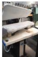
Reference: CUM-024 Iron Industrial Machine Year: - Brand: Pantex Width: -