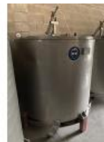
Reference: MIC-059E jacketed mix tank, 316 SS, 1.5... Year: 1997 Brand: LOPIK Width: .