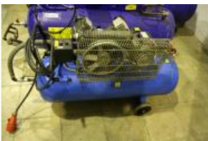
Reference: TPL-022 Compressor Year: 1997 Brand: Air Pack Width: .