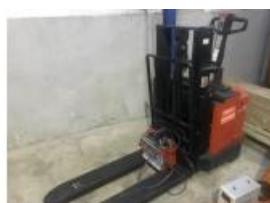
Reference: F-6501 LIFTER Year: 2000 Brand: BT Width: .