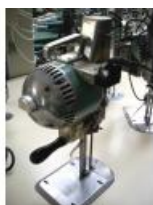
Reference: CUM-192 Cut Manual Year: . Brand: Pacer Width: .