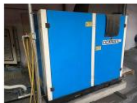
Reference: STV-017 SCREW COMPRESSOR 55kw Year: 1995 Brand: MARK Width: .