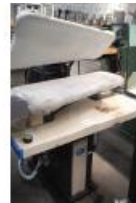
Reference: CUM-024 Iron Industrial Machine Year: - Brand: Pantex Width: -