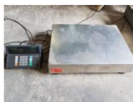
Reference: M-1588 SCALE 60kg Year: . Brand: TOLEDO Width: .