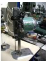
Reference: CUM-158 Cut Manual Year: . Brand: Pacer Width: .