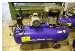
Reference: TPL-020 Compressor Year: 1997 Brand: Air Pack Width: .