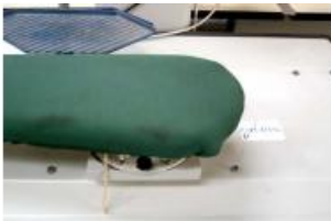
Reference: CUM-034 Iron Industrial Machine Year: 1998 Brand: Primula Width: -