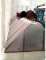
Reference: COT-001 Fume Hood Year: . Brand: . Width: .