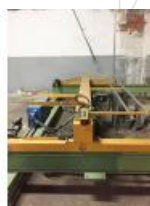
Reference: MTB-066 BRIDGE CRANE 2.5Ton Year: 2003 Brand: VERLINDE Width: .