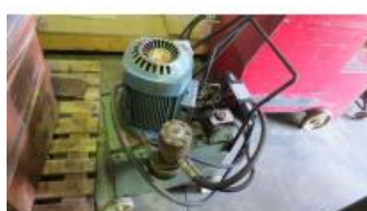
Reference: TPA-062 Hydraulic Unit Year: . Brand: Tapa Width: .