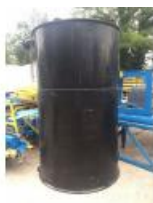
Reference: MIC-0700 TANK 3500 liters Year: 1997 Brand: CHEMICAL STORAGE ENGINEERING Width: .