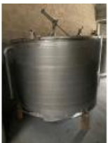
Reference: MIC-061F jacketed mix tank, 316 SS, 3.... Year: 1997 Brand: LOPIK Width: .