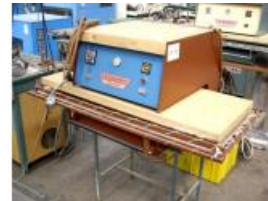
Reference: CUM-196 Iron Industrial Machine Year: . Brand: Giconmes Width: .