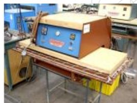
Reference: CUM-196 Iron Industrial Machine Year: . Brand: Giconmes Width: .