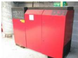
Reference: M-929 Compressor sciew Year: 1992 Brand: Eco Air Width: .