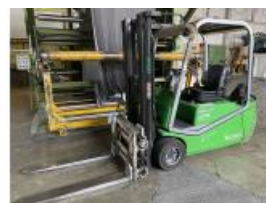
Reference: STV-018 ELECTRIC FORK LIFT 2000kg Year: 2003 Brand: CESAB Width: .