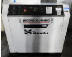
Reference: CTB-157A AIR COMPRESSOR 18.5KW Year: 1998 Brand: Ingersollrand Width: .