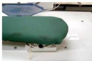
Reference: CUM-034 Iron Industrial Machine Year: 1998 Brand: Primula Width: -