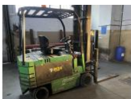
Reference: STV-021 ELECTRIC FORK LIFT 3000kg Year: . Brand: CESAB Width: .