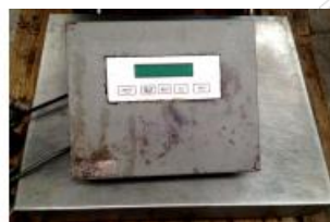
Reference: LUI-159 Scales Platform 60kg Year: - Brand: . Width: -