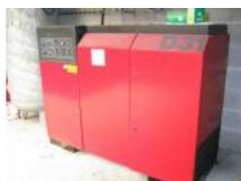
Reference: M-929 Compressor scrow Year: 1992 Brand: Eco Air Width: .