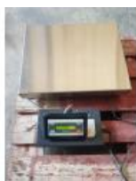
Reference: AZC-035 SCALE 60kg Year: . Brand: Sartorius Width: .