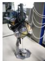
Reference: CUM-161 Cut Manual Year: . Brand: Singer Width: .