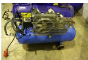
Reference: TPL-022 Compressor Year: 1997 Brand: Air Pack Width: .