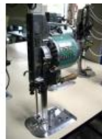
Reference: CUM-157 Cut Manual Year: . Brand: Pacer Width: .