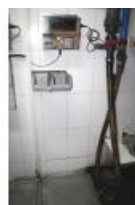
Reference: EST-30 Scale 150kg Year: . Brand: Mobba Width: .