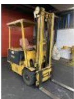
Reference: STV-019 ELECTRIC FORK LIFT 2000kg Year: . Brand: CESAB Width: .