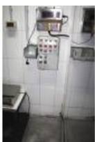
Reference: EST-31 Scale 150kg Year: . Brand: Mobba Width: .