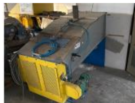
Reference: MIC-061B SIEVING UNIT Year: 2005 Brand: WERKHUIZEN SCHEPENS Width: .