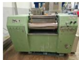
Reference: M-1699 THREE-CYLINDER REFINER Year: 1988 Brand: TALLERES MIRALLES Width: .