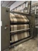
Reference: AV7-011 DECATIZING CONTINUOUS MACHINE Year: 1987 Brand: Sperotto Rimar Width: 1900