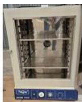
Reference: MRC-004 DRYING OVEN Year: . Brand: RAYPA Width: .