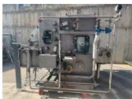
Reference: M-1670 WASHING BOX SHARK Year: . Brand: TVE Escalé Width: 2000