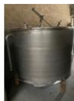
Reference: MIC-061F jacketed mix tank, 316 SS, 3... Year: 1997 Brand: LOPIK Width: .