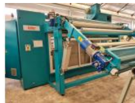
Reference: M-1694 STABILIZATION MACHINE WITH FEL... Year: 2011 Brand: Lafer Width: 2400