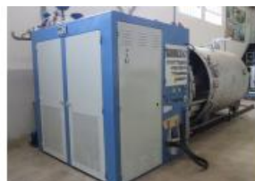
Reference: SAS-017 Jigger high temperature RENEWED Year: 1982 Brand: MCS Width: 2600