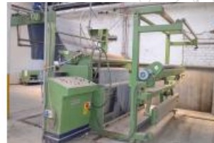
Reference: FNX2-216 Squeezing and finishing padder Year: 1999 Brand: Artos Width: 2000