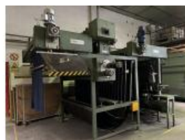
Reference: AV7-013 PREPARATION MACHINE Year: 1998 Brand: Corino Width: 2000