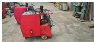
Reference: AV7-020 ROTARY HIDRAULIC UNIT Year: . Brand: Asisa Width: .