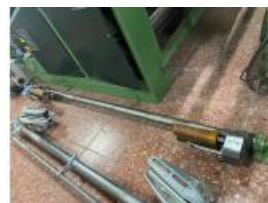
Reference: CCTT-055 GUIDING DEVICE Year: . Brand: E+L Width: .