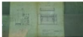
Reference: M-1719 NEEDLE WHEEL WEFT STRAIGHTENER Year: 1986 Brand: Corino Width: 2000