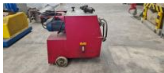
Reference: AV7-021 ROTARY HIDRAULIC UNIT Year: . Brand: Asisa Width: .