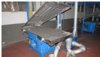
Reference: MIC-059B SIEVING UNIT Year: 2005 Brand: FUCHS Width: .