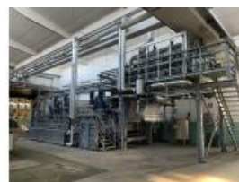
Reference: TFN-013 WASHING MACHINE OPEN WIDTH Year: 1998 Brand: CIMI Width: 2000