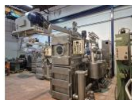
Reference: AV7-003 JET ATMOSPHERIC 100kg Year: 1999 Brand: COMIX Width: .