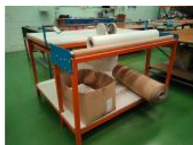
Reference: TTR-003 INSPECTING TABLE WITH COUNTER Year: . Brand: . Width: 1800