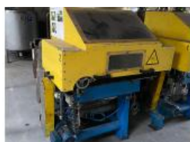
Reference: MIC-060A ROTARY CUTTER FLOCK Year: 2005 Brand: H&H Width: 432