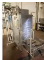
Reference: MRC-002 DYEING CABINET Year: 2007 Brand: GRANDIS Width: .