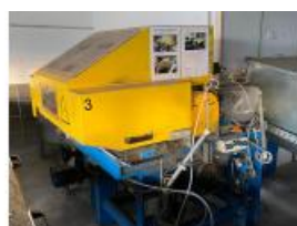
Reference: MIC-061A ROTARY CUTTER FLOCK Year: 2005 Brand: H&H Width: 432