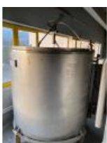
Reference: MIC-061E jacketed mix tank, 316 SS, 1.5... Year: 1997 Brand: LOPIK Width: .