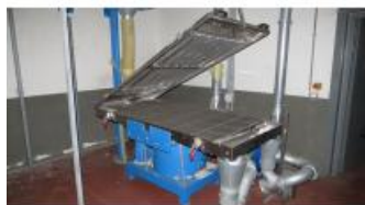
Reference: MIC-059D SIEVING UNIT Year: 2005 Brand: FUCHS Width: .