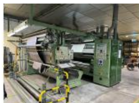
Reference: M-1709 SHEARING & CLEANING MACHINE Year: 1990 Brand: Torres Maquinaria Textil Width: 3000