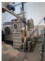
Reference: AV7-004 JET ATMOSPHERIC 15kg Year: 1998 Brand: Minox Width: .