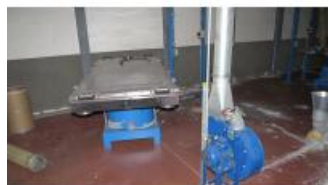
Reference: MIC-060C SIEVING UNIT Year: 2005 Brand: FUCHS Width: .