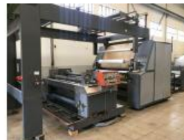
Reference: M-1626 STORK Coating Line Roller Widt... Year: 1989 Brand: Stork Width: 2000