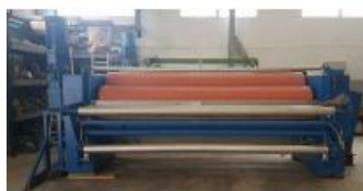
Reference: CCMA-001 FINISHING PADDER Year: 2002 Brand: Bruckner Width: 3200