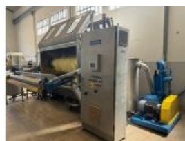
Reference: AV7-008 JIGGER ELECTRONIC D1300 Year: 2002 Brand: TVE Escala Width: 2200