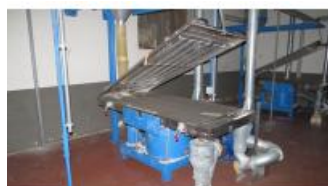
Reference: MIC-059C SIEVING UNIT Year: 2005 Brand: FUCHS Width: .