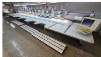
Reference: JSO-003 EMBROIDERY MACHINE 15 HEADS Year: 2005 Brand: ZSK Width: .