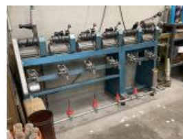
Reference: TTR-041 WINDER 6 cones Year: . Brand: Motocono Width: .