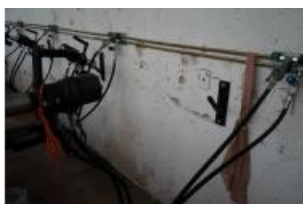
Reference: CCTT-045 ROTATING STATION 6 POINTS Year: . Brand: MENZEL Width: .