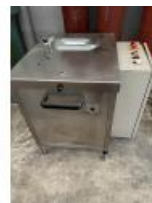
Reference: M-1714 UNSTITCHING MACHINE Year: . Brand: Bianco Width: .