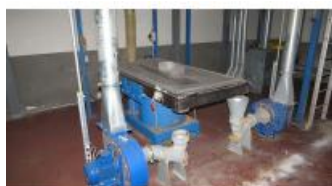
Reference: MIC-060B SIEVING UNIT Year: 2005 Brand: FUCHS Width: .