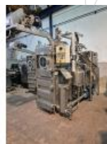
Reference: AV7-005 JET ATMOSPHERIC 30kg Year: 1999 Brand: COMIX Width: .