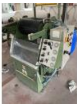
Reference: LEG-002 SQUEEZING PADDER for samples. Year: . Brand: Bianco Width: 400