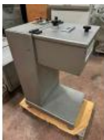
Reference: M-1713 UNSTITCHING MACHINE Year: 2001 Brand: Corino Width: .