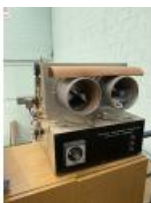
Reference: TTR-014 TEST PILLING Year: . Brand: ATLAS Width: .