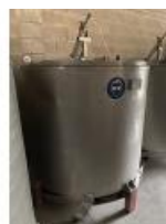
Reference: MIC-059E jacketed mix tank, 316 SS, 1.5... Year: 1997 Brand: LOPIK Width: .