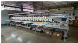
Reference: JSO-001 EMBROIDERY MACHINE 12 HEADS Year: 2005 Brand: SWF Width: .