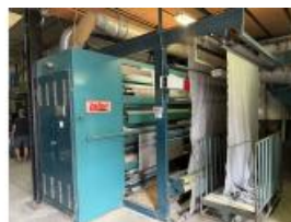
Reference: AV7-012 SHEARING MACHINE Year: 1991 Brand: Lafer Width: 2000