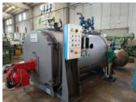
Reference: AV7-014 STEAM BOILER 1750kg Year: 2016 Brand: PERELLÓ I.VAR Width: .