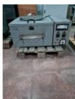
Reference: M-1712 LABORATORY STENTER Year: . Brand: Werner Mathis AG Width: .