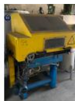
Reference: MIC-059A ROTARY CUTTER FLOCK Year: 2005 Brand: H&H Width: 432