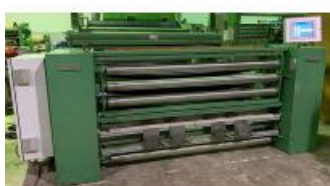
Reference: FNX2-268 WEFTSTRAIGHTENER Year: 2000/2008 Brand: BIANCO/CORINO Width: 2000