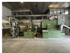
Reference: AV7-009 SANFORISING MACHINE FOR FABRIC... Year: 1995 Brand: MUZZI Width: 2000