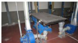
Reference: MIC-060D SIEVING UNIT Year: 2005 Brand: FUCHS Width: .