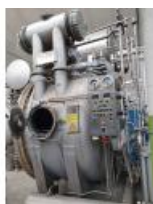
Reference: FNX2-233 Jet dyeing machine H.T. 2 ROPE Year: 2001 Brand: MCS Width: .