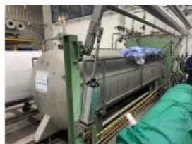
Reference: M-1662 JIGGER HIGH TEMPERATURE 3600mm Year: 1997 Brand: MCS Width: 3600