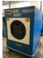
Reference: ATG-006 DRYER 30kg Year: 1998 Brand: Maino Inox Width: .