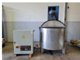
Reference: MUS-001 Preparator for Thickeners And ... Year: 2005 Brand: Fimat Width: .