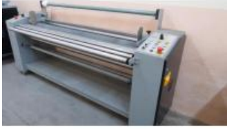
Reference: QTX-007 ROLLING MACHINE Year: 2004 Brand: STI SERVIZI TECNICI INTEGRATI Width: 1940