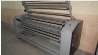
Reference: QTX-008 UNROLLING MACHINE Year: 2005 Brand: STI SERVIZI TECNICI INTEGRATI Width: 1940