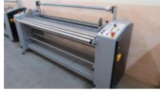
Reference: QTX-006 ROLLING MACHINE Year: 2005 Brand: STI SERVIZI TECNICI INTEGRATI Width: 1940