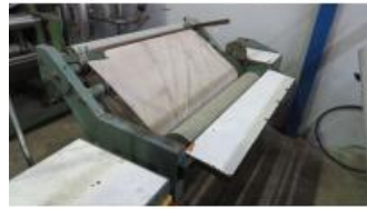
Reference: TXD-035 Rolling Machine 1000mm Year: . Brand: Massana Width: 1000