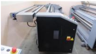
Reference: QTX-009 UNROLLING MACHINE Year: 2005 Brand: STI SERVIZI TECNICI INTEGRATI Width: 1940