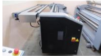
Reference: QTX-010 UNROLLING MACHINE Year: 2005 Brand: STI SERVIZI TECNICI INTEGRATI Width: 1940