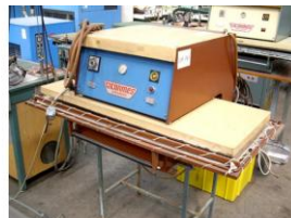
Reference: CUM-196 Iron Industrial Machine Year: . Brand: Giconmes Width: .