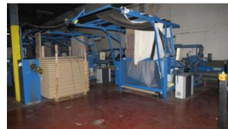
Reference: MIC-039 Inspecting and Rolling Machine Year: 1997 Brand: MATTHYS Width: 2000