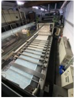
Reference: STV-003 ROTARY PRINTING MACHINE 9 COLO... Year: 1995 Brand: Reggiani Width: 3200mm WW