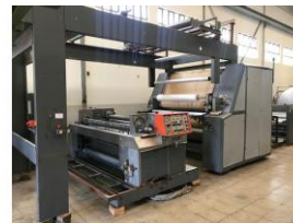
Reference: M-1626 STORK Coating Line Roller Wid... Year: 1989 Brand: Stork Width: 2000