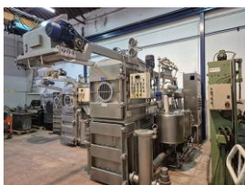
Reference: AV7-003 JET ATMOSPHERIC 100kg Year: 1999 Brand: COMIX Width: .