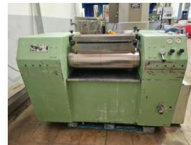
Reference: M-1699 THREE-CYLINDER REFINER Year: 1988 Brand: TALLERES MIRALLES Width: .