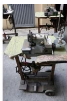
Reference: M-1325 Sewing machine pneumatic Year: . Brand: Romert Width: 0