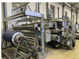
Reference: TES-001 SANFORISING MACHINE Year: 1991 Brand: Monforts Width: 2100