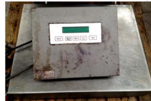
Reference: LUI-159 Scales Platform 60kg Year: - Brand: . Width: -