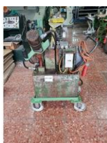
Reference: CCTT-049 ROTARY HYDRAULIC UNIT 4kw Year: . Brand: . Width: ..