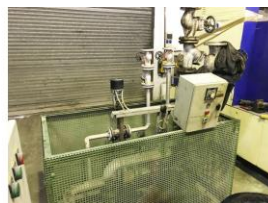
Reference: SDS-012 THERMIC OIL TEMPERATURE REGULA... Year: . Brand: . Width: .