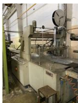
Reference: STV-014 PACKING RETRACTILE MACHINE Year: 1990 Brand: IMPACK Width: .