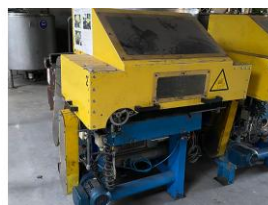
Reference: MIC-060A ROTARY CUTTER FLOCK Year: 2005 Brand: H&H Width: 432