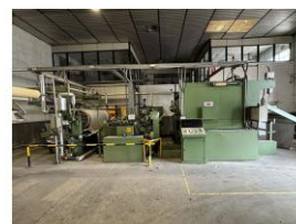
Reference: AV7-009 SANFORISING MACHINE FOR FABRIC... Year: 1995 Brand: MUZZI Width: 2000