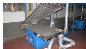
Reference: MIC-059B SIEVING UNIT Year: 2005 Brand: FUCHS Width: .