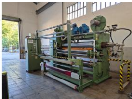
Reference: M-1733 CALANDER KUSTERS Year: 1986 Brand: Kusters Width: 2000