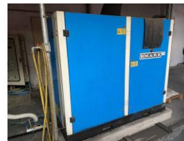
Reference: STV-017 SCREW COMPRESSOR 55kw Year: 1995 Brand: MARK Width: .