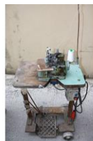
Reference: M-1330 Sewing machine (electric) Year: - Brand: Gubtor Width: 0