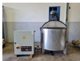
Reference: MUS-001 Preparator for Thickeners And ... Year: 2005 Brand: Fimat Width: .