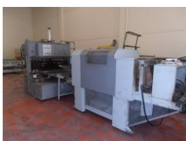
Reference: LVS-002 PACKING MACHINE Year: . Brand: CIPRO Width: .