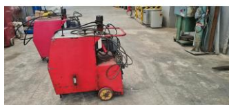
Reference: AV7-020 ROTARY HIDRAULIC UNIT Year: . Brand: Asisa Width: .