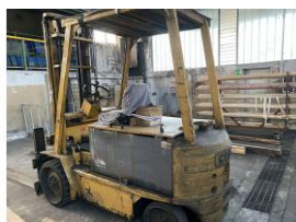
Reference: STV-020 ELECTRIC FORK LIFT 4000kg Year: 1989 Brand: CESAB Width: .