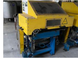
Reference: MIC-060A ROTARY CUTTER FLOCK Year: 2005 Brand: H&H Width: 432