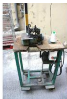
Reference: M-1331 Sewing machine (electric) Year: - Brand: Gubtor Width: 0