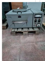
Reference: M-1712 LABORATORY STENTER Year: . Brand: Werner Mathis AG Width: .