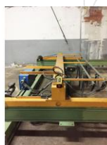
Reference: MTB-066 BRIDGE CRANE 2.5Ton Year: 2003 Brand: VERLINDE Width: .