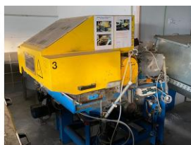
Reference: MIC-061A ROTARY CUTTER FLOCK Year: 2005 Brand: H&H Width: 432