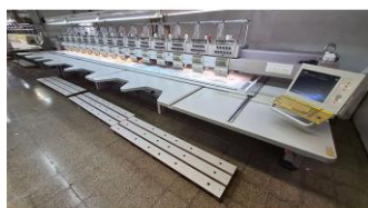
Reference: JSO-003 EMBROIDERY MACHINE 15 HEADS Year: 2005 Brand: ZSK Width: .