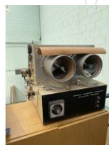
Reference: TTR-014 TEST PILLING Year: . Brand: ATLAS Width: .