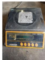
Reference: M-1585 SCALE 11kg Year: . Brand: JADEVER Width: .