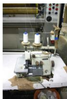
Reference: EST-35 Sewing machine (electric) Year: . Brand: Brother Width: .