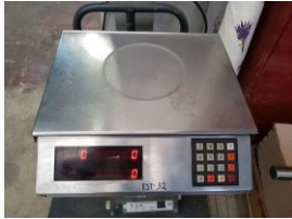
Reference: EST-32 Scale 30kg Year: . Brand: Mobba Width: .