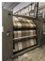
Reference: AV7-011 DECATIZING CONTINUOUS MACHINE Year: 1987 Brand: Sperotto Rimar Width: 1900