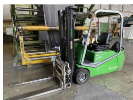
Reference: STV-018 ELECTRIC FORK LIFT 2000kg Year: 2003 Brand: CESAB Width: .