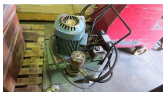
Reference: TPA-062 Hydraulic Unit Year: . Brand: Tapa Width: .