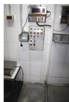
Reference: EST-31 Scale 150kg Year: . Brand: Mobba Width: .