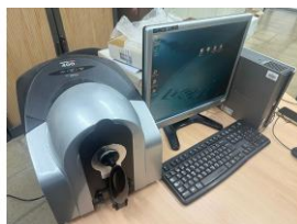
Reference: MRC-003 DATACOLOR 400 COMPLETE Year: 2008 Brand: Datacolor Width: .