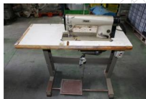
Reference: M-1335 Sewing machine Year: - Brand: PFAF Width: 0