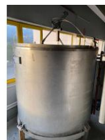
Reference: MIC-061E jacketed mix tank, 316 SS, 1.5... Year: 1997 Brand: LOPIK Width: .