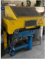
Reference: MIC-059A ROTARY CUTTER FLOCK Year: 2005 Brand: H&H Width: 432