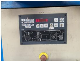
Reference: STV-016 SCREW COMPRESSOR 55kw Year: 1998 Brand: MARK Width: .