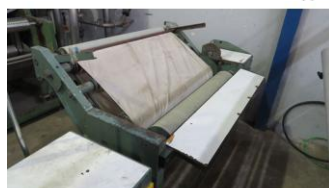
Reference: TXD-035 Rolling Machine 1000mm Year: . Brand: Massana Width: 1000