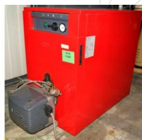
Reference: BLY-026 HEATING BOILER Year: 1997 Brand: Savio Width: .