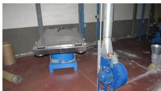
Reference: MIC-060C SIEVING UNIT Year: 2005 Brand: FUCHS Width: .