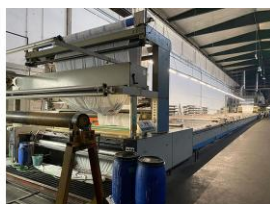
Reference: STV-002 FLAT BED PRINTING MACHINE 9 co... Year: 1995 Brand: Reggiani Width: 3200mm WW