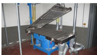
Reference: MIC-059D SIEVING UNIT Year: 2005 Brand: FUCHS Width: .