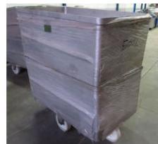
Reference: M-1514 Trolley Stainless steel For We... Year: 2012 Brand: . Width: .