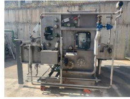
Reference: M-1670 WASHING BOX SHARK Year: . Brand: TVE Escale Width: 2000