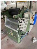
Reference: LEG-002 SQUEEZING PADDER for samples. Year: . Brand: Bianco Width: 400