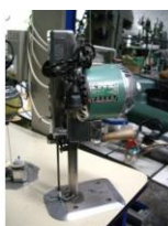
Reference: CUM-158 Cut Manual Year: . Brand: Pacer Width: .