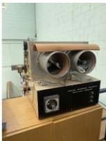
Reference: TTR-014 TEST PILLING Year: . Brand: ATLAS Width: .