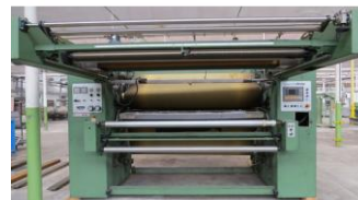
Reference: FNX-249 COMPACTOR Year: 1999 Brand: Sperotto Rimar Width: 2400