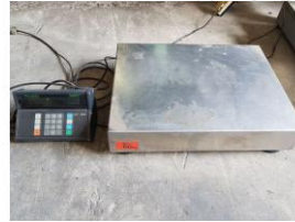
Reference: M-1588 SCALE 60kg Year: . Brand: TOLEDO Width: .