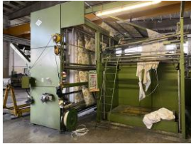
Reference: STV-015 FOLDING MACHINE AND PALLETIZIN... Year: 1992 Brand: LAZZATI FRANCO Width: 3600mm