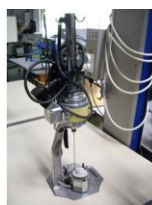
Reference: CUM-161 Cut Manual Year: . Brand: Singer Width: .