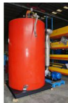
Reference: RGR-002 THERMIC OIL BOILER Year: 1985 Brand: Pirobloc Width: .