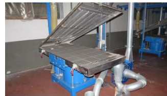
Reference: MIC-059B SIEVING UNIT Year: 2005 Brand: FUCHS Width: .