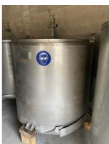
Reference: MIC-060E jacketed mix tank, 316 SS, 1.5... Year: 1997 Brand: LOPIK Width: .