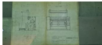
Reference: M-1719 NEEDLE WHEEL WEFT STRAIGHTENER Year: 1986 Brand: Corino Width: 2000