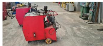
Reference: AV7-020 ROTARY HIDRAULIC UNIT Year: . Brand: Asisa Width: .