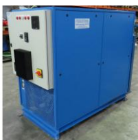
Reference: MIC-070B HOT WATER GENERATOR Year: 2006 Brand: FRICONTROL Width: .