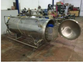
Reference: M-1161 Steamer Year: 2004 Brand: CCMT Width: 0