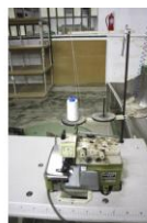
Reference: EST-36 Sewing machine (electric) Year: . Brand: Siruba Width: .