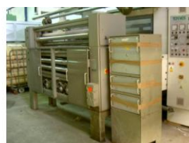
Reference: M-1271 Weft straightener Year: 1987 Brand: Mahlo Width: 2000