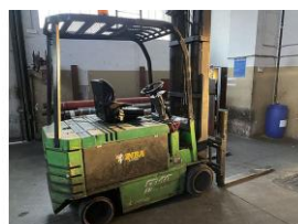
Reference: STV-021 ELECTRIC FORK LIFT 3000kg Year: . Brand: CESAB Width: .