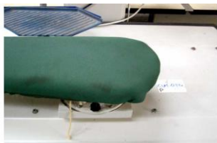
Reference: CUM-034 Iron Industrial Machine Year: 1998 Brand: Primula Width: -