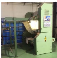
Reference: QTX-001 Preparation Machine A-Frame Year: 1996 Brand: Tapalsa Width: 1900