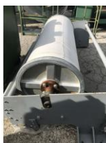
Reference: M-1636 STEAM CYLINDER FOR SANFORIZING LINE Year: 2015 Brand: Tapa Width: 1800