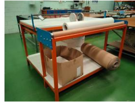
Reference: TTR-003 INSPECTING TABLE WITH COUNTER Year: . Brand: . Width: 1800