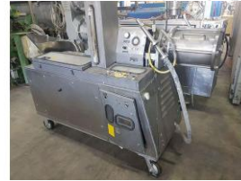
Reference: CCMA-006 AERATOR Year: . Brand: HANSAWERKE Width: .