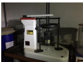
Reference: MIC-2650 TEST SIEVE SHAKER Year: . Brand: W. S. TYLER Width: .