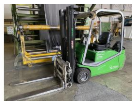
Reference: STV-018 ELECTRIC FORK LIFT 2000kg Year: 2003 Brand: CESAB Width: .