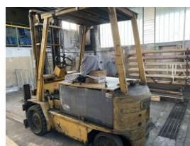
Reference: STV-020 ELECTRIC FORK LIFT 4000kg Year: 1989 Brand: CESAB Width: .