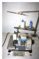
Reference: EST-33 Sewing machine (electric) Year: . Brand: Singer Width: .