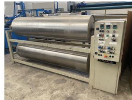
Reference: F-6727 WUMAG water-cooled drums ( 2 c... Year: 1993 Brand: Wumag Width: 2400