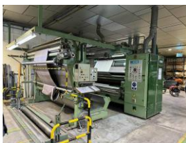
Reference: M-1709 SHEARING & CLEANING MACHINE Year: 1990 Brand: Torres Maquinaria T xtil Width: 3000