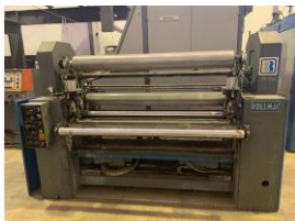
Reference: FNX2-211 COATING HEAD Year: 1993 Brand: ROLLMAC Width: 1800