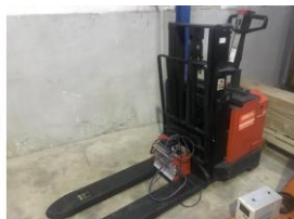
Reference: F-6501 LIFTER Year: 2000 Brand: BT Width: .