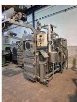
Reference: AV7-005 JET ATMOSPHERIC 30kg Year: 1999 Brand: COMIX Width: .