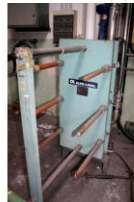
Reference: LUI-024 Heat Exchanger Year: 1981 Brand: Alfa-Laval Width: .