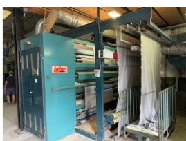
Reference: AV7-012 SHEARING MACHINE Year: 1991 Brand: Lafer Width: 2000