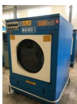
Reference: ATG-006 DRYER 30kg Year: 1998 Brand: Maino Inox Width: .