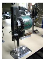
Reference: CUM-157 Cut Manual Year: . Brand: Pacer Width: .