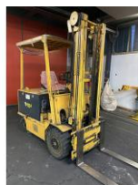
Reference: STV-019 ELECTRIC FORK LIFT 2000kg Year: . Brand: CESAB Width: .