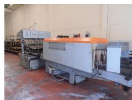
Reference: LVS-001 PACKING MACHINE Year: . Brand: IM2 Width: .