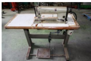
Reference: M-1334 Sewing machine Year: - Brand: PFAF Width: 0