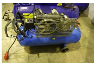
Reference: TPL-022 Compressor Year: 1997 Brand: Air Pack Width: .