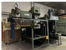
Reference: AV7-013 PREPARATION MACHINE Year: 1998 Brand: Corino Width: 2000