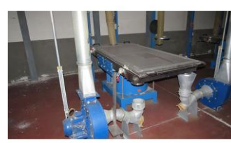
Reference: MIC-060D SIEVING UNIT Year: 2005 Brand: FUCHS Width: .