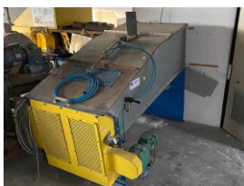
Reference: MIC-061B SIEVING UNIT Year: 2005 Brand: WERKHUIZEN SCHEPENS Width: .