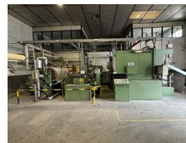
Reference: AV7-009 SANFORISING MACHINE FOR FABRIC... Year: 1995 Brand: MUZZI Width: 2000