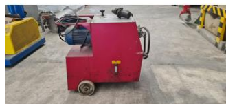
Reference: AV7-021 ROTARY HIDRAULIC UNIT Year: . Brand: Asisa Width: .