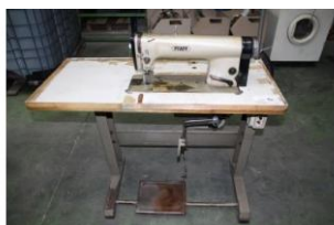
Reference: M-1336 sewing machine Year: - Brand: PFAF Width: 0