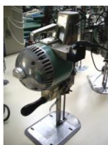
Reference: CUM-192 Cut Manual Year: . Brand: Pacer Width: .