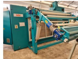
Reference: M-1694 STABILIZATION MACHINE WITH FEL... Year: 2011 Brand: Lafer Width: 2400