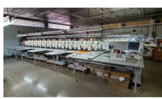
Reference: JSO-001 EMBROIDERY MACHINE 12 HEADS Year: 2005 Brand: SWF Width: .