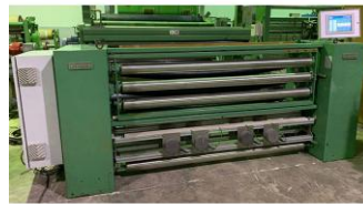
Reference: FNX2-268 WEFTSTRAIGHTENER Year: 2000/2008 Brand: BIANCO/CORINO Width: 2000