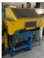
Reference: MIC-059A ROTARY CUTTER FLOCK Year: 2005 Brand: H&H Width: 432