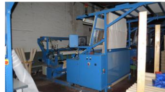
Reference: MIC-037 Inspecting and Rolling Machine Year: 1997 Brand: MATTHYS Width: 2000