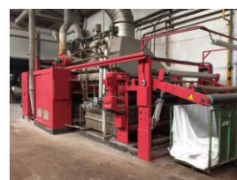
Reference: ARG-001 SINGEING AND PAD-BATCH Year: 1990 Brand: Fite Width: 2000