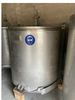
Reference: MIC-060E jacketed mix tank, 316 SS, 1.5... Year: 1997 Brand: LOPIK Width: .