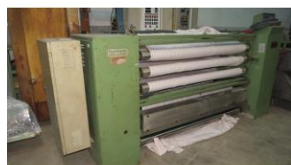
Reference: DIV-002 Weft straightener Year: 1986 Brand: Bianco Width: 1800