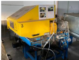
Reference: MIC-061A ROTARY CUTTER FLOCK Year: 2005 Brand: H&H Width: 432