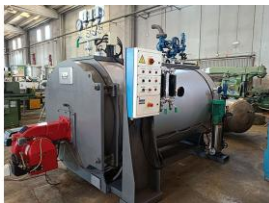
Reference: AV7-014 STEAM BOILER 1750kg Year: 2016 Brand: PERELLÓ I.VAR Width: .