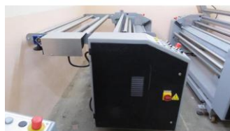
Reference: QTX-010 UNROLLING MACHINE Year: 2005 Brand: STI SERVIZI TECNICI INTEGRATI Width: 1940