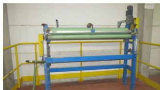
Reference: MIC-070L LAY ROLL CYLINDER Year: 2006 Brand: DE MEYER Width: 2000