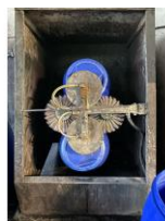
Reference: STV-007 WASHER FOR COLOUR CUBE Year: . Brand: Colombo Width: .