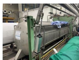
Reference: M-1662 JIGGER HIGH TEMPERATURE 3600mm Year: 1997 Brand: MCS Width: 3600