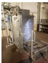
Reference: MRC-002 DYEING CABINET Year: 2007 Brand: GRANDIS Width: .