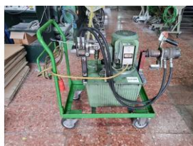
Reference: CCTT-054 ROTARY HYDRAULIC UNIT 4kw Year: . Brand: . Width: .