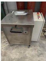
Reference: M-1714 UNSTITCHING MACHINE Year: . Brand: Bianco Width: .