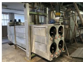
Reference: STV-006 WASHER FOR 4 CREELS Year: . Brand: Cominox Width: 3200mm WW