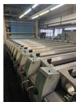
Reference: STV-004 ROTARY PRINTING MACHINE 13 COL... Year: 1997 Brand: Reggiani Width: 3200mm WW