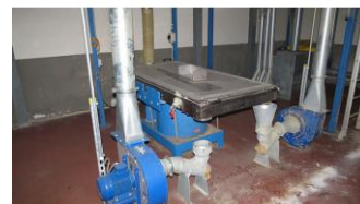
Reference: MIC-060B SIEVING UNIT Year: 2005 Brand: FUCHS Width: .