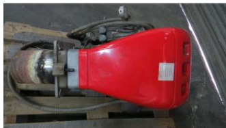
Reference: DIV-003 BURNER FUEL Year: 1996 Brand: ROCA Width: .