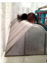
Reference: COT-001 Fume Hood Year: . Brand: . Width: .