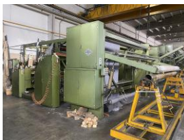
Reference: STV-012 INSPECTION AND ROLLING MACHINE... Year: 1988 Brand: LAZZATI FRANCO Width: 3200mm