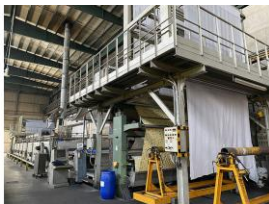
Reference: STV-008 STENTER 7 CHAMBERS 3400mm Year: 1990 Brand: Reggiani Width: 3400mm