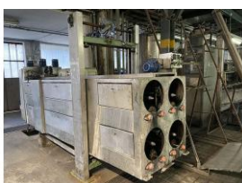
Reference: STV-006 WASHER FOR 4 CREELS Year: . Brand: Cominox Width: 3200mm WW