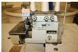
Reference: TC-034A Sewing machine electric 3 threads Year: . Brand: Brother Width: .