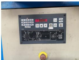
Reference: STV-016 SCREW COMPRESSOR 55kw Year: 1998 Brand: MARK Width: .