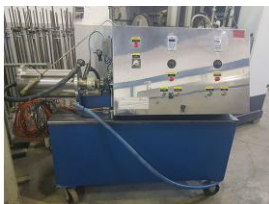
Reference: CCMA-007 AERATOR Year: 2007 Brand: AUSTRO MAQUINAS (JANTEX) Width: .