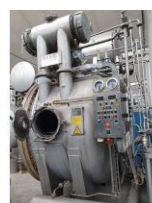
Reference: FNX2-233 Jet dyeing machine H.T. 2 ROPE Year: 2001 Brand: MCS Width: .