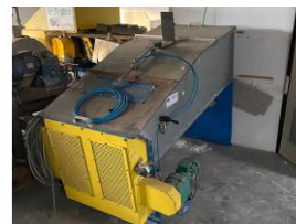
Reference: MIC-061B SIEVING UNIT Year: 2005 Brand: WERKHUIZEN SCHEPENS Width: .