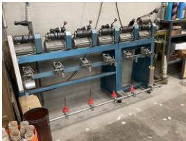
Reference: TTR-041 WINDER 6 conos Year: . Brand: Motocono Width: .