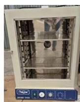
Reference: MRC-004 DRYING OVEN Year: . Brand: RAYPA Width: .