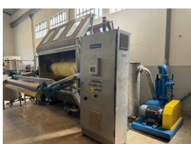
Reference: AV7-008 JIGGER ELECTRONIC D1300 Year: 2002 Brand: TVE Escala Width: 2200