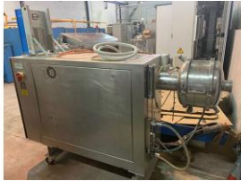
Reference: CCMA-005 AERATOR Year: 1996 Brand: MONDOMIX Width: .