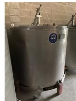
Reference: MIC-059E jacketed mix tank, 316 SS, 1.5... Year: 1997 Brand: LOPIK Width: .