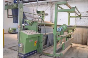
Reference: FNX2-216 Squeezing and finishing padder Year: 1999 Brand: Artos Width: 2000