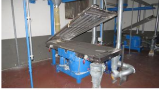
Reference: MIC-059C SIEVING UNIT Year: 2005 Brand: FUCHS Width: .