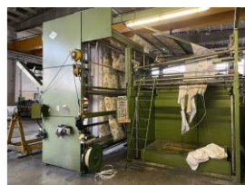
Reference: STV-015 FOLDING MACHINE AND PALLETIZIN... Year: 1992 Brand: LAZZATI FRANCO Width: 3600mm