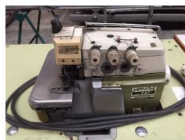
Reference: ESC57 Sewing machine electric 3 threads Year: - Brand: Siruba Width: 0