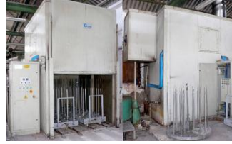
Reference: LAN-110 Dryer (Bobines) Year: 1998 Brand: Galvanin Width: 0