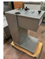
Reference: M-1713 UNSTITCHING MACHINE Year: 2001 Brand: Corino Width: .