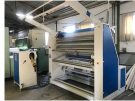
Reference: M-1634 Inspecting and Rolling Machine Year: . Brand: Macotex Width: 2000