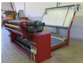
Reference: M-1553 Inspecting and Rolling Machine Year: . Brand: . Width: 2000