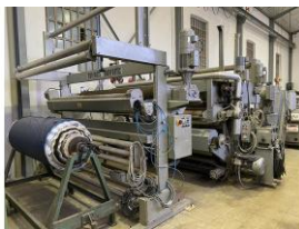
Reference: TES-001 SANFORISING MACHINE Year: 1991 Brand: Monforts Width: 2100