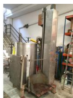
Reference: MIC-002B VAN WYK Filter for paste Year: 1986 Brand: Vanwyk Width: .