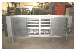
Reference: M-1340 Weft straightener Year: 1988 Brand: Mahlo Width: 2400