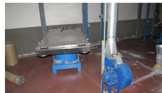
Reference: MIC-060C SIEVING UNIT Year: 2005 Brand: FUCHS Width: .