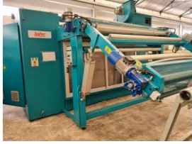
Reference: M-1694 STABILIZATION MACHINE WITH FEL... Year: 2011 Brand: Lafer Width: 2400