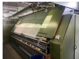
Reference: STV-013 INSPECTION AND ROLLING MACHINE... Year: 1989 Brand: LAZZATI FRANCO Width: 3200mm