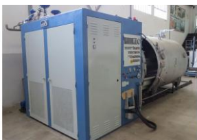
Reference: SAS-017 Jigger high temperature RENEWED Year: 1982 Brand: MCS Width: 2600