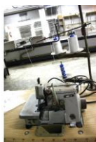
Reference: EST-37 Sewing machine (electric) Year: . Brand: Brother Width: .