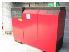
Reference: M-929 Compressor scREW Year: 1992 Brand: Eco Air Width: .