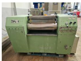
Reference: M-1699 THREE-CYLINDER REFINER Year: 1988 Brand: TALLERES MIRALLES Width: .