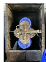
Reference: STV-007 WASHER FOR COLOUR CUBE Year: . Brand: Colombo Width: .