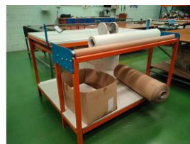
Reference: TTR-003 INSPECTING TABLE WITH COUNTER Year: . Brand: . Width: 1800