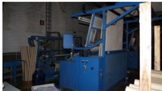
Reference: MIC-038 Inspecting and Rolling Machine Year: 1997 Brand: MATTHYS Width: 2000