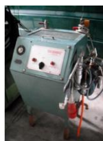
Reference: CUM-211 Steam Boiler Year: . Brand: Giconmes Width: .