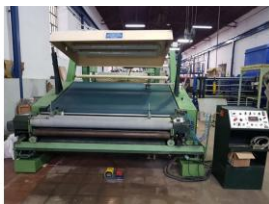
Reference: SDT-020 Inspecting and Rolling Machine Year: 1989 Brand: Offri Width: 2200