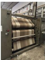
Reference: AV7-011 DECATIZING MACHINE CONTINUOUS Year: 1987 Brand: Sperotto Rimar Width: 1900