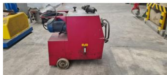
Reference: AV7-021 ROTARY HIDRAULIC UNIT Year: . Brand: Asisa Width: .