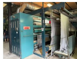
Reference: AV7-012 SHEARING MACHINE Year: 1991 Brand: Lafer Width: 2000