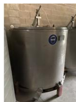
Reference: MIC-059E jacketed mix tank, 316 SS, 1.5... Year: 1997 Brand: LOPIK Width: .