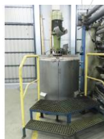
Reference: MIC-003A TANK for paste Ø 1.250 x h 1.... Year: . Brand: . Width: .