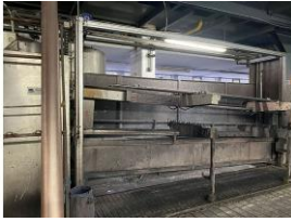
Reference: STV-005 WASHER FOR CREELS Year: . Brand: Cominox Width: 3200mm WW