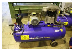
Reference: TPL-020 Compressor Year: 1997 Brand: Air Pack Width: .