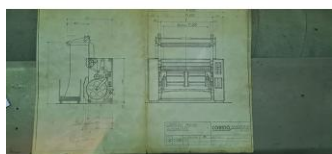
Reference: M-1719 NEEDLE WHEEL WEFT STRAIGHTENER Year: 1986 Brand: Corino Width: 2000