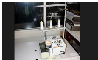
Reference: TTE-16 Sewing machine 3 threads Year: - Brand: Siruba Width: 0