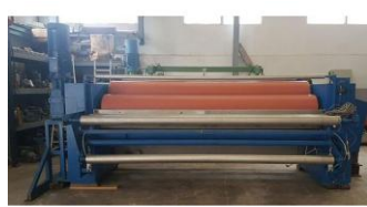
Reference: CCMA-001 FINISHING PADDER Year: 2002 Brand: Bruckner Width: 3200