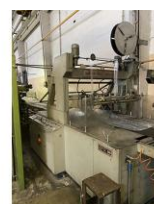
Reference: STV-014 PACKING RETRACTILE MACHINE Year: 1990 Brand: IMPACK Width: .