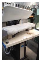
Reference: CUM-024 Iron Industrial Machine Year: - Brand: Pantex Width: -