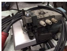
Reference: ESC60 Sewing machine electric 3 threads Year: . Brand: . Width: 0