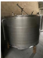
Reference: MIC-061F jacketed mix tank, 316 SS, 3... Year: 1997 Brand: LOPIK Width: .