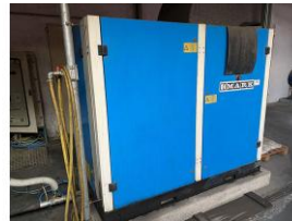
Reference: STV-017 SCREW COMPRESSOR 55kw Year: 1995 Brand: MARK Width: .