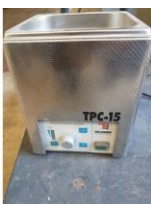
Reference: M-1590 ULTRASONICS POWER CLEANING Year: . Brand: TELSONIC Width: .