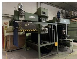
Reference: AV7-013 PREPARATION MACHINE Year: 1998 Brand: Corino Width: 2000