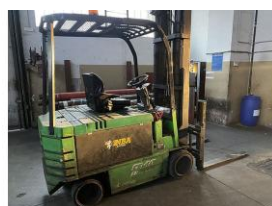
Reference: STV-021 ELECTRIC FORK LIFT 3000kg Year: . Brand: CESAB Width: .