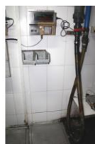
Reference: EST-30 Scale 150kg Year: . Brand: Mobba Width: .