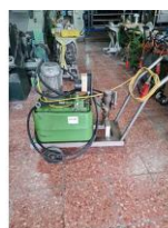
Reference: CCTT-052 ROTARY HYDRAULIC UNIT 4kw Year: . Brand: . Width: .