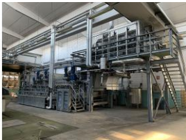
Reference: TFN-013 WASHING MACHINE OPEN WIDTH Year: 1998 Brand: CIMI Width: 2000