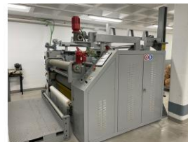
Reference: M-1679 CALENDAR FOR LAMINATION Year: 2002 Brand: BERGI Width: 1900