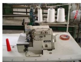
Reference: TC-034C Sewing machine electric 3 threads Year: . Brand: Brother Width: .