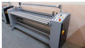
Reference: QTX-006 ROLLING MACHINE Year: 2005 Brand: STI SERVIZI TECNICI INTEGRATI Width: 1940