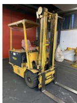
Reference: STV-019 ELECTRIC FORK LIFT 2000kg Year: . Brand: CESAB Width: .