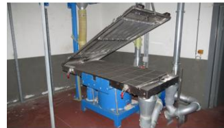
Reference: MIC-059D SIEVING UNIT Year: 2005 Brand: FUCHS Width: .