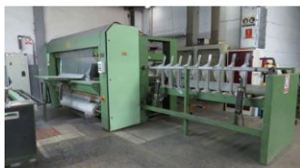
Reference: MTB-025 PACKING MACHINE Year: 1991 Brand: Tapalsa Width: 2400