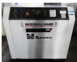
Reference: CTB-157A AIR COMPRESSOR 18.5KW Year: 1998 Brand: Ingersollrand Width: .