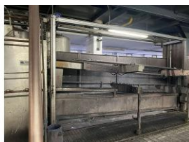
Reference: STV-005 WASHER FOR CREELS Year: . Brand: Cominox Width: 3200mm WW