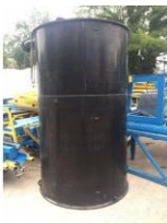
Reference: MIC-0700 TANK 3500 liters Year: 1997 Brand: CHEMICAL STORAGE ENGINEERING Width: .