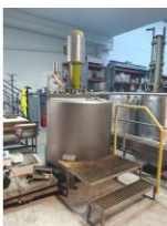
Reference: MIC-002E TANK for paste Ø 1.250 x h 1.... Year: . Brand: . Width: .