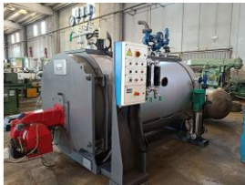
Reference: AV7-014 STEAM BOILER 1750kg Year: 2016 Brand: PERELLÓ I.VAR Width: .