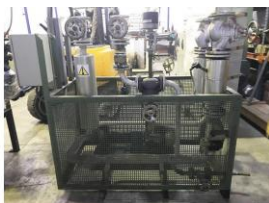
Reference: SDS-011 THERMIC OIL TEMPERATURE REGULA... Year: . Brand: . Width: .