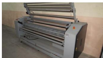
Reference: QTX-008 UNROLLING MACHINE Year: 2005 Brand: STI SERVIZI TECNICI INTEGRATI Width: 1940