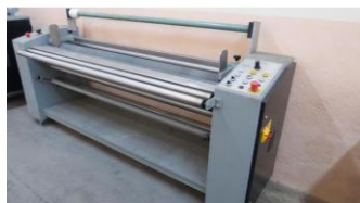
Reference: QTX-007 ROLLING MACHINE Year: 2004 Brand: STI SERVIZI TECNICI INTEGRATI Width: 1940