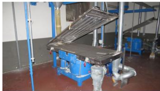
Reference: MIC-059C SIEVING UNIT Year: 2005 Brand: FUCHS Width: .