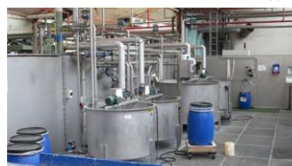
Reference: MIC-031 PRODUCT KITCHEN 4 TANKS Year: 2008 Brand: . Width: .