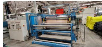
Reference: APR-002 CALANDER 3 BOWLS Year: . Brand: Kleinewefers Width: 1700