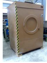
Reference: M-1401 Tumbler discontinuous Year: 1990 Brand: Anglada Width: .