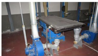
Reference: MIC-060D SIEVING UNIT Year: 2005 Brand: FUCHS Width: .