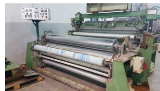
Reference: M-1669 KISS ROLL COATING HEAD Year: 1989 Brand: ISOTEX Width: 2200