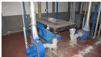
Reference: MIC-060B SIEVING UNIT Year: 2005 Brand: FUCHS Width: .