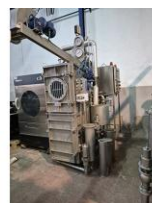
Reference: AV7-004 JET ATMOSPHERIC 15kg Year: 1998 Brand: Minox Width: .