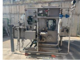
Reference: M-1670 WASHING BOX SHARK Year: . Brand: TVE Escale Width: 2000