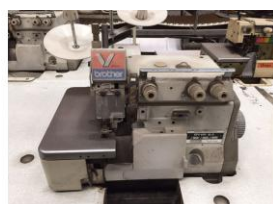
Reference: TC-034B Sewing machine electric 3 threads Year: . Brand: Brother Width: .