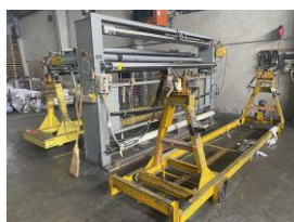
Reference: STV-001 PREPARATION MACHINE FOR A-FRAME Year: . Brand: . Width: 3400mm