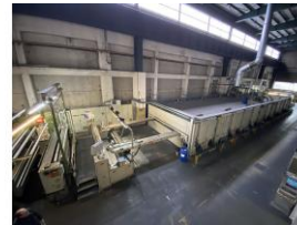
Reference: STV-009 STENTER 6 CHAMBERS of 4 meters... Year: 2001 Brand: Reggiani Width: 3400mm