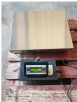
Reference: AZC-035 SCALE 60kg Year: . Brand: Sartorius Width: .