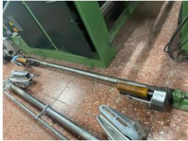
Reference: CCTT-055 GUIDING DEVICE Year: . Brand: E+L Width: .