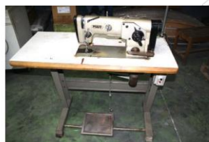
Reference: M-1337 Sewing machine Year: - Brand: PFAF Width: 0