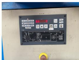
Reference: STV-016 SCREW COMPRESSOR 55kw Year: 1998 Brand: MARK Width: .