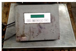
Reference: LUI-159 Scales Platform 60kg Year: - Brand: . Width: -