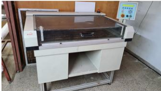
Reference: JSO-013 TISSUE MARKING AND CUTTING LAS... Year: 1998 Brand: RICAMAR Width: .