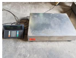
Reference: M-1588 SCALE 60kg Year: . Brand: TOLEDO Width: .