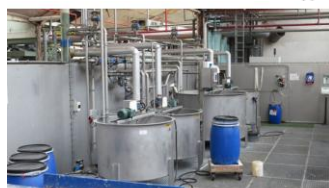
Reference: MIC-031 PRODUCT KITCHEN 4 TANKS Year: 2008 Brand: . Width: .