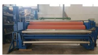
Reference: CCMA-001 FINISHING PADDER Year: 2002 Brand: Bruckner Width: 3200