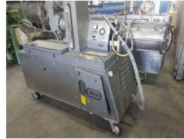
Reference: CCMA-006 AERATOR Year: . Brand: HANSAWERKE Width: .