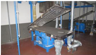
Reference: MIC-059C SIEVING UNIT Year: 2005 Brand: FUCHS Width: .