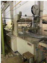
Reference: STV-014 PACKING RETRACTILE MACHINE Year: 1990 Brand: IMPACK Width: .