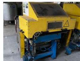
Reference: MIC-060A ROTARY CUTTER FLOCK Year: 2005 Brand: H&H Width: 432