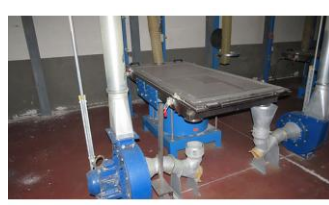
Reference: MIC-060D SIEVING UNIT Year: 2005 Brand: FUCHS Width: .