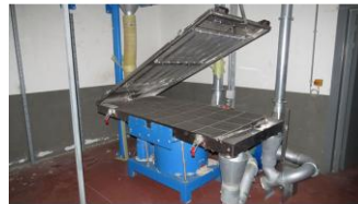
Reference: MIC-059D SIEVING UNIT Year: 2005 Brand: FUCHS Width: .