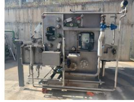
Reference: M-1670 WASHING BOX SHARK Year: . Brand: TVE Escale Width: 2000