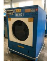
Reference: ATG-006 DRYER 30kg Year: 1998 Brand: Maino Inox Width: .