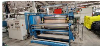
Reference: APR-002 CALANDER 3 BOWLS Year: . Brand: Kleinewefers Width: 1700