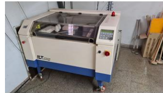
Reference: JSO-012 TISSUE MARKING AND CUTTING LAS... Year: 2002 Brand: INTERLAS TECHNOLOGY Width: .