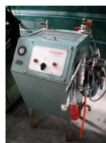
Reference: CUM-211 Steam Boiler Year: . Brand: Giconmes Width: .