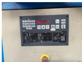
Reference: STV-016 SCREW COMPRESSOR 55kw Year: 1998 Brand: MARK Width: .