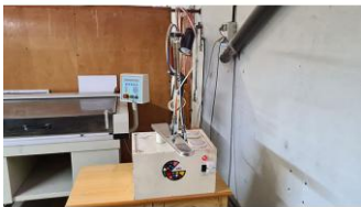
Reference: JSO-014 WASHING MACHINE PERCLORO Year: . Brand: Silc Width: .