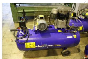
Reference: TPL-020 Compressor Year: 1997 Brand: Air Pack Width: .