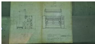
Reference: M-1719 NEEDLE WHEEL WEFT STRAIGHTENER Year: 1986 Brand: Corino Width: 2000