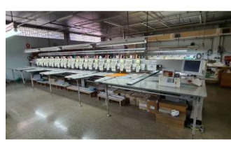
Reference: JSO-001 EMBROIDERY MACHINE 12 HEADS Year: 2005 Brand: SWF Width: .