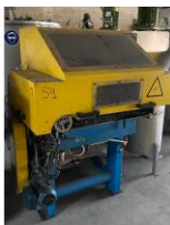
Reference: MIC-059A ROTARY CUTTER FLOCK Year: 2005 Brand: H&H Width: 432