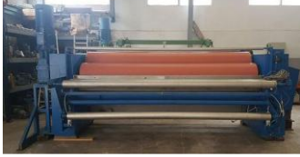
Reference: CCMA-001 FINISHING PADDER Year: 2002 Brand: Bruckner Width: 3200