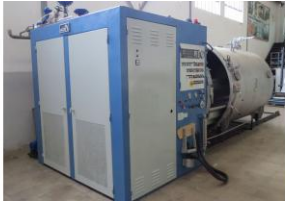
Reference: SAS-017 Jigger high temperature RENEWED Year: 1982 Brand: MCS Width: 2600