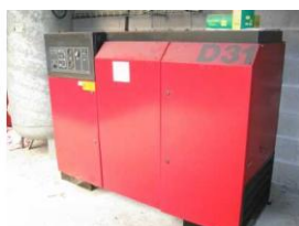
Reference: M-929 Compressor scREW Year: 1992 Brand: Eco Air Width: .