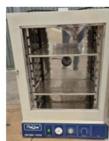
Reference: MRC-004 DRYING OVEN Year: . Brand: RAYPA Width: .