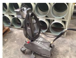
Reference: ACT-004 Sewing machine Year: . Brand: WILLIAM BIRCH Width: .