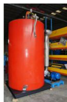
Reference: RGR-002 THERMIC OIL BOILER Year: 1985 Brand: Pirobloc Width: .