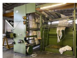
Reference: STV-015 FOLDING MACHINE AND PALLETIZIN... Year: 1992 Brand: LAZZATI FRANCO Width: 3600mm