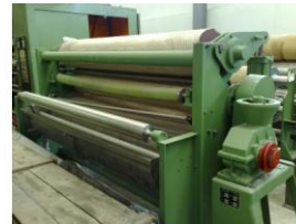
Reference: M-1002 Squeezing and finishing padder Year: 1988 Brand: Artos Width: 2200