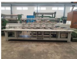
Reference: BOR-001 Embroidering 6 heads Year: 2003 Brand: FEIYA Width: .