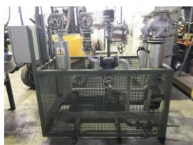
Reference: SDS-011 THERMIC OIL TEMPERATURE REGULA... Year: . Brand: . Width: .