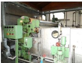
Reference: CR-039C Squeezing padder Year: 1990 Brand: Kusters Width: 2400