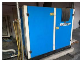
Reference: STV-017 SCREW COMPRESSOR 55kw Year: 1995 Brand: MARK Width: .