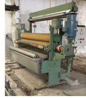
Reference: MTB-021 IMPREGNATION PADDER Year: . Brand: Tapa Width: 2000