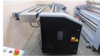
Reference: QTX-010 UNROLLING MACHINE Year: 2005 Brand: STI SERVIZI TECNICI INTEGRATI Width: 1940