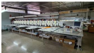
Reference: JSO-001 EMBROIDERY MACHINE 12 HEADS Year: 2005 Brand: SWF Width: .