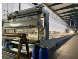
Reference: STV-002 FLAT BED PRINTING MACHINE 9 co... Year: 1995 Brand: Reggiani Width: 3200mm WW