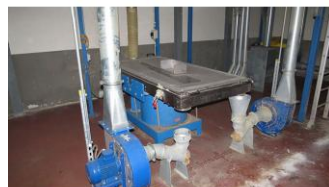
Reference: MIC-060B SIEVING UNIT Year: 2005 Brand: FUCHS Width: .