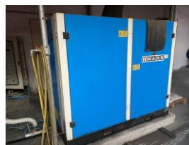
Reference: STV-017 SCREW COMPRESSOR 55kw Year: 1995 Brand: MARK Width: .