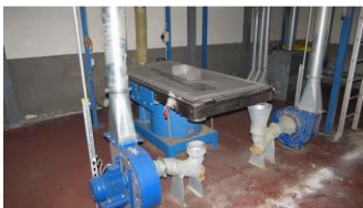
Reference: MIC-060B SIEVING UNIT Year: 2005 Brand: FUCHS Width: .