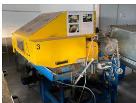
Reference: MIC-061A ROTARY CUTTER FLOCK Year: 2005 Brand: H&H Width: 432