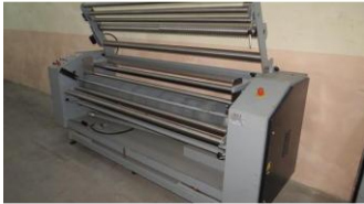
Reference: QTX-008 UNROLLING MACHINE Year: 2005 Brand: STI SERVIZI TECNICI INTEGRATI Width: 1940