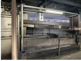
Reference: STV-005 WASHER FOR CREELS Year: . Brand: Cominox Width: 3200mm WW