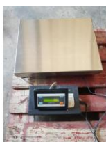
Reference: AZC-035 SCALE 60kg Year: . Brand: Sartorius Width: .