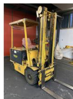
Reference: STV-019 ELECTRIC FORK LIFT 2000kg Year: . Brand: CESAB Width: .