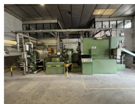
Reference: AV7-009 SANFORISING MACHINE FOR FABRIC... Year: 1995 Brand: MUZZI Width: 2000