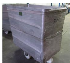
Reference: M-1514 Trolley Stainless steel For We... Year: 2012 Brand: . Width: .