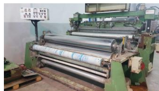
Reference: M-1669 KISS ROLL COATING HEAD Year: 1989 Brand: ISOTEX Width: 2200