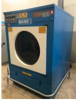
Reference: ATG-005 DRYER 30kg Year: 1998 Brand: Maino Inox Width: .