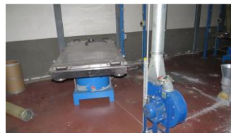
Reference: MIC-060C SIEVING UNIT Year: 2005 Brand: FUCHS Width: .