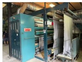
Reference: AV7-012 SHEARING MACHINE Year: 1991 Brand: Lafer Width: 2000