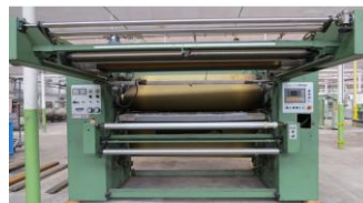
Reference: FNX-249 COMPACTOR Year: 1999 Brand: Sperotto Rimar Width: 2400