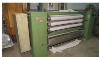
Reference: DIV-002 Weft staightener Year: 1986 Brand: Bianco Width: 1800