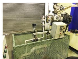
Reference: SDS-012 THERMIC OIL TEMPERATURE REGULA... Year: . Brand: . Width: .