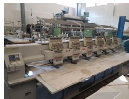
Reference: BOR-004 Embroidering 6 heads Year: 2003 Brand: FEIYA Width: .