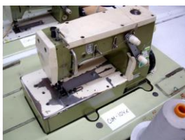
Reference: CUM-104 Sewing Machine Year: . Brand: Rimoldi Width: .