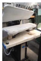
Reference: CUM-024 Iron Industrial Machine Year: - Brand: Pantex Width: -