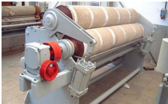
Reference: CC0015 Squeezing and finishing padder Year: 1983 Brand: Benguerel Width: 2400