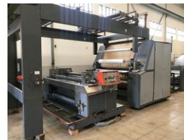
Reference: M-1626 STORK Coating Line Roller Widt... Year: 1989 Brand: Stork Width: 2000