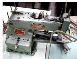
Reference: CUM-113 Sewing Machine Year: . Brand: Lewis Width: .