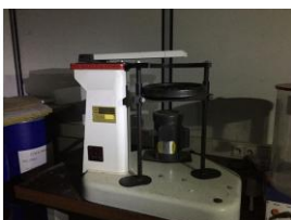
Reference: MIC-2650 TEST SIEVE SHAKER Year: . Brand: W. S. TYLER Width: .