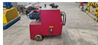
Reference: AV7-021 ROTARY HIDRAULIC UNIT Year: . Brand: Asisa Width: .