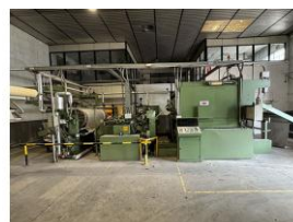
Reference: AV7-009 SANFORISING MACHINE FOR FABRIC... Year: 1995 Brand: MUZZI Width: 2000