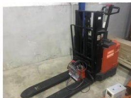
Reference: F-6501 LIFTER Year: 2000 Brand: BT Width: .