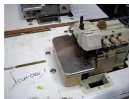
Reference: CUM-070 Sewing Machine Year: . Brand: Ching Chi Width: .