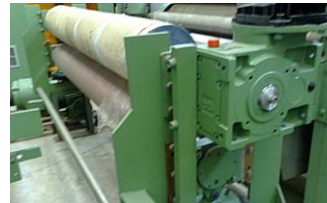
Reference: CC0087 Squeezing padder Year: 1999 Brand: Intes Width: 2000