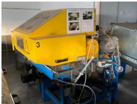
Reference: MIC-061A ROTARY CUTTER FLOCK Year: 2005 Brand: H&H Width: 432