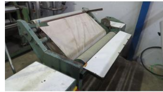
Reference: TXD-035 Rolling Machine 1000mm Year: . Brand: Massana Width: 1000