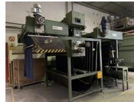
Reference: AV7-013 PREPARATION MACHINE Year: 1998 Brand: Corino Width: 2000