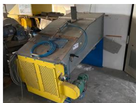
Reference: MIC-061B SIEVING UNIT Year: 2005 Brand: WERKHUIZEN SCHEPENS Width: .