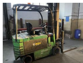
Reference: STV-021 ELECTRIC FORK LIFT 3000kg Year: . Brand: CESAB Width: .