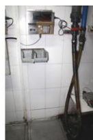
Reference: EST-30 Scale 150kg Year: . Brand: Mobba Width: .