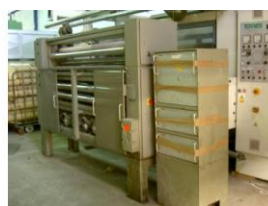
Reference: M-1271 Weft straightener Year: 1987 Brand: Mahlo Width: 2000