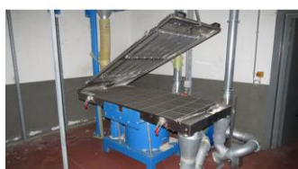
Reference: MIC-059D SIEVING UNIT Year: 2005 Brand: FUCHS Width: .