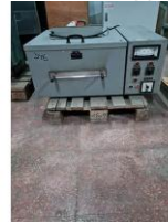
Reference: M-1712 LABORATORY STENTER Year: . Brand: Werner Mathis AG Width: .