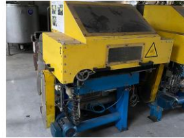
Reference: MIC-060A ROTARY CUTTER FLOCK Year: 2005 Brand: H&H Width: 432