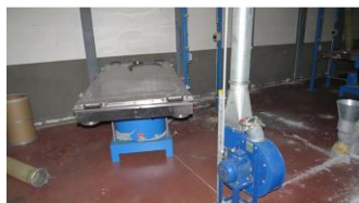
Reference: MIC-060C SIEVING UNIT Year: 2005 Brand: FUCHS Width: .