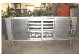
Reference: M-1340 Weft staightener Year: 1988 Brand: Mahlo Width: 2400