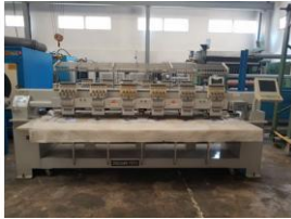
Reference: BOR-003 Embroidering 6 heads Year: 2003 Brand: FEIYA Width: .