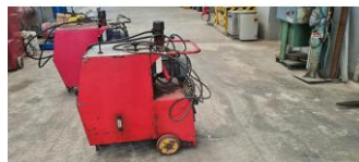
Reference: AV7-020 ROTARY HIDRAULIC UNIT Year: . Brand: Asisa Width: .