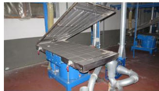
Reference: MIC-059B SIEVING UNIT Year: 2005 Brand: FUCHS Width: .