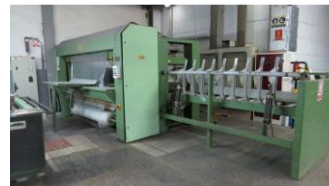
Reference: MTB-025 PACKING MACHINE Year: 1991 Brand: Tapalsa Width: 2400