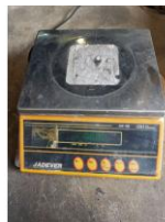
Reference: M-1585 SCALE 11kg Year: . Brand: JADEVER Width: .