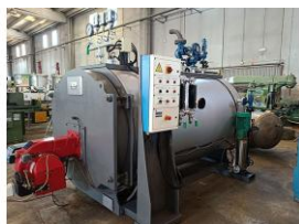
Reference: AV7-014 STEAM BOILER 1750kg Year: 2016 Brand: PERELLÓ I.VAR Width: .