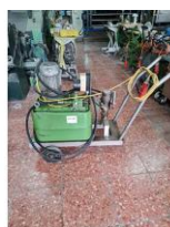
Reference: CCTT-052 ROTARY HYDRAULIC UNIT 4kw Year: . Brand: . Width: .