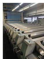
Reference: STV-004 ROTARY PRINTING MACHINE 13 COL... Year: 1997 Brand: Reggiani Width: 3200mm WW