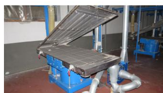
Reference: MIC-059B SIEVING UNIT Year: 2005 Brand: FUCHS Width: .