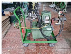
Reference: CCTT-054 ROTARY HYDRAULIC UNIT 4kw Year: . Brand: . Width: .