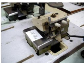
Reference: CUM-189 Sewing Machine Year: . Brand: Rimoldi Width: .