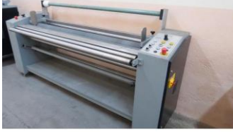
Reference: QTX-007 ROLLING MACHINE Year: 2004 Brand: STI SERVIZI TECNICI INTEGRATI Width: 1940