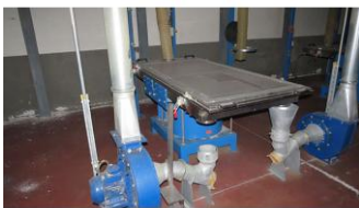
Reference: MIC-060D SIEVING UNIT Year: 2005 Brand: FUCHS Width: .