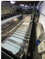
Reference: STV-003 ROTARY PRINTING MACHINE 9 COLO... Year: 1995 Brand: Reggiani Width: 3200mm WW