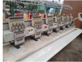
Reference: BOR-002 Embroidering 6 heads Year: 2004 Brand: FEIYA Width: .