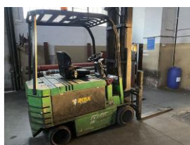
Reference: STV-021 ELECTRIC FORK LIFT 3000kg Year: . Brand: CESAB Width: .