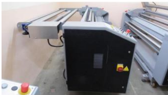
Reference: QTX-009 UNROLLING MACHINE Year: 2005 Brand: STI SERVIZI TECNICI INTEGRATI Width: 1940