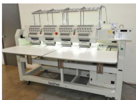
Reference: LQS-001 Embroidery machine with 4 Head... Year: 2012 Brand: Brother Width: .