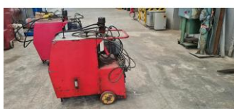
Reference: AV7-020 ROTARY HIDRAULIC UNIT Year: . Brand: Asisa Width: .