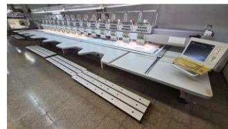
Reference: JSO-003 EMBROIDERY MACHINE 15 HEADS Year: 2005 Brand: ZSK Width: .