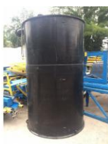
Reference: MIC-0700 TANK 3500 liters Year: 1997 Brand: CHEMICAL STORAGE ENGINEERING Width: .