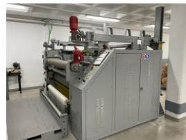
Reference: M-1679 CALENDAR FOR LAMINATION Year: 2002 Brand: BERGI Width: 1900