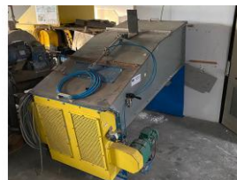
Reference: MIC-061B SIEVING UNIT Year: 2005 Brand: WERKHUIZEN SCHEPENS Width: .