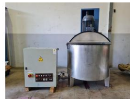
Reference: MUS-001 Preparator for Thickeners And ... Year: 2005 Brand: Fimat Width: .