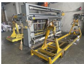
Reference: STV-001 PREPARATION MACHINE FOR A-FRAME Year: . Brand: . Width: 3400mm