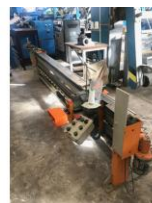
Reference: SDT-022 OPEN-WIDTH TESTA SEWING MACHINE Year: . Brand: Merrow Width: 2400