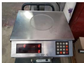
Reference: EST-32 Scale 30kg Year: . Brand: Mobba Width: .