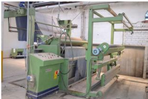
Reference: FNX2-216 Squeezing and finishing padder Year: 1999 Brand: Artos Width: 2000