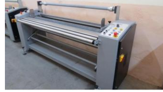
Reference: QTX-006 ROLLING MACHINE Year: 2005 Brand: STI SERVIZI TECNICI INTEGRATI Width: 1940