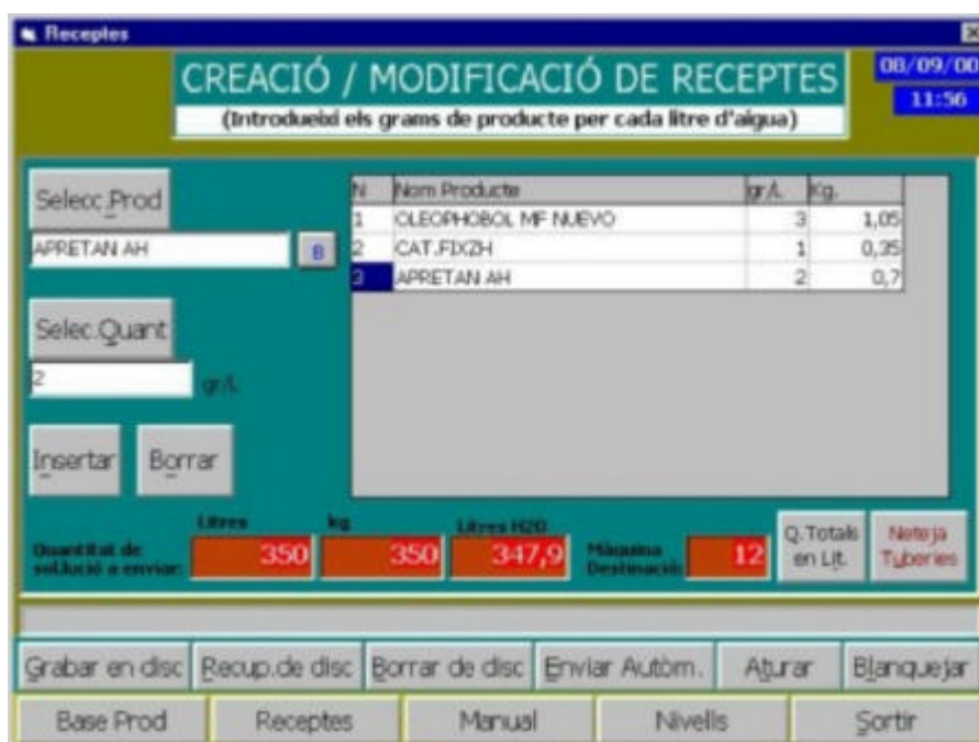
Recipes edition screen